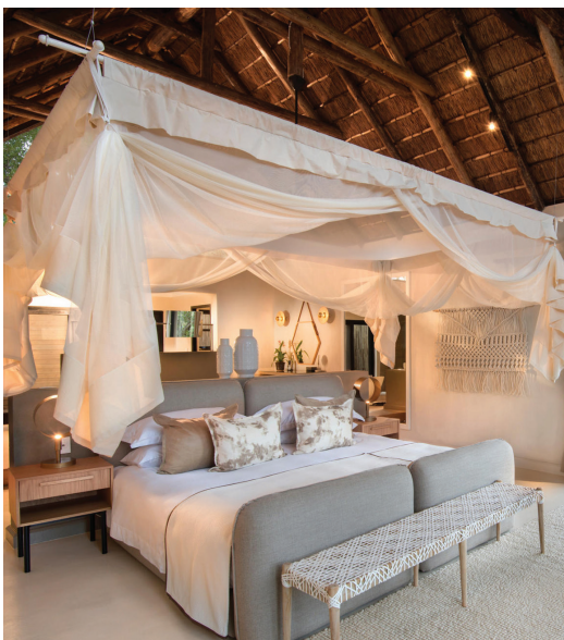
Luxury Room, Lion Sands River Lodge