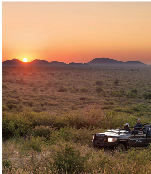
Madikwe Game Drive