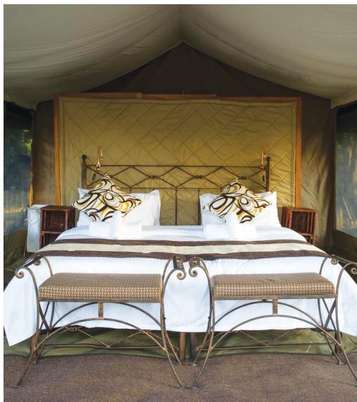
Enaidura Luxury Camp

Today you will leave the Crater and head to Lake Manyara for a game drive with a picnic lunch. The area is renowned for its tree climbing lions and large herds of elephant. Continue on to Arusha where you will overnight at FOUR POINTS BY SHERATON ARUSHA. (B, L)